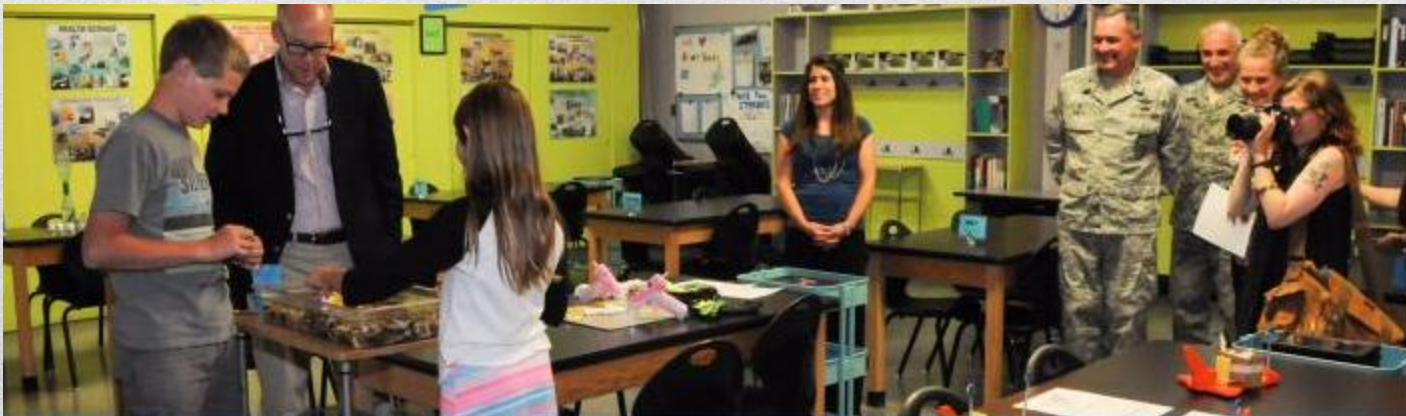
U.S. Rep. Greg Walden (R-OR) Visits STARBASE Kingsley